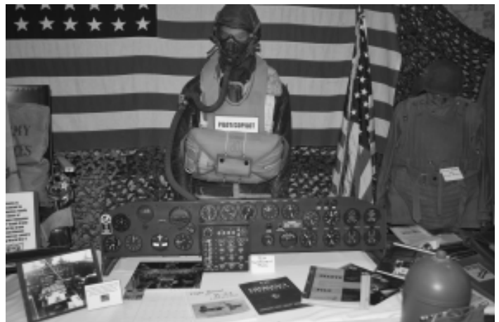
The "449th Museum" Exhibit