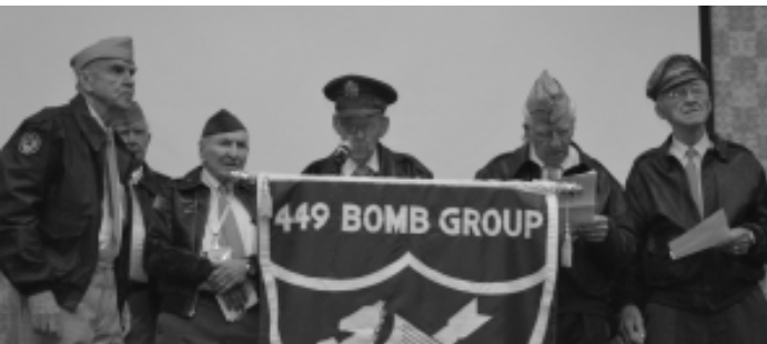
"A Wing and a Prayer" Group