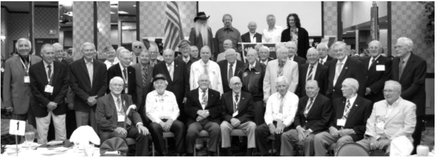
The 449th Veterans with the Oak Ridge Boys (back row) and General Chuck Yeager (center, back row)

(Cont'd from page 1 -- "President's Report")