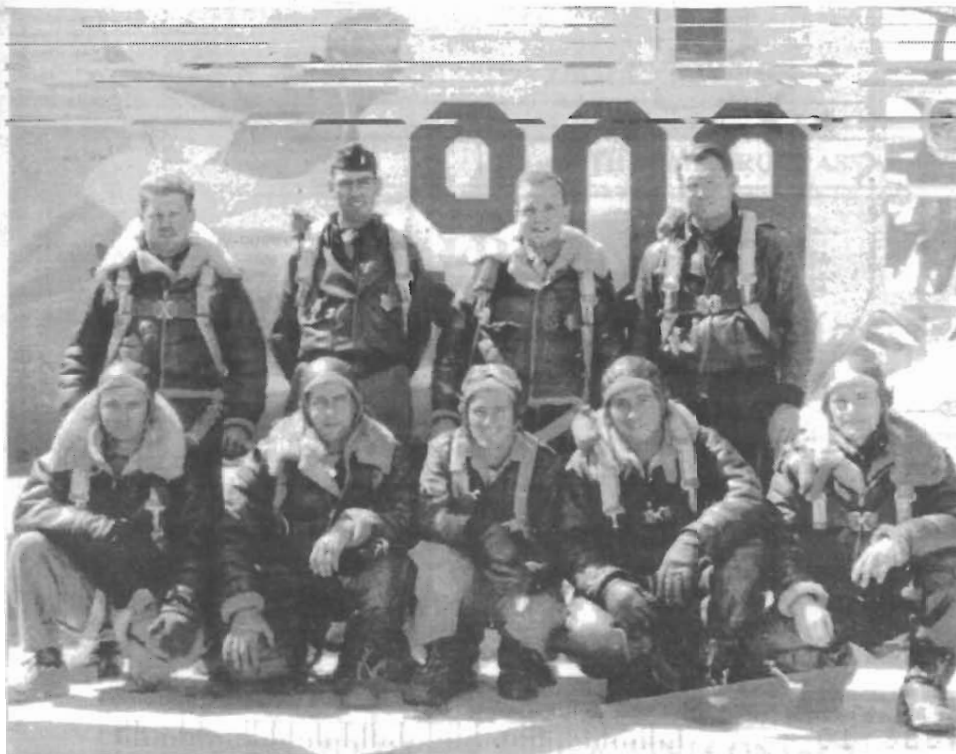
Photo taken during training at Muroc AAF, California, March 44.