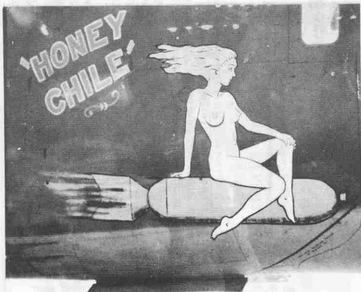
(NO OTHER INFO ON THESE TWO 449th BOMB GROUP SHIPS)