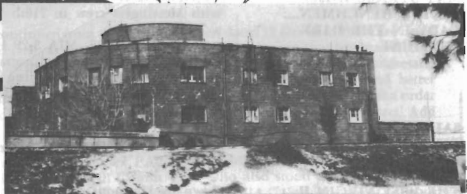
GROTTAGLIE AIR BASE, ITALY ....former Italian Airfield Admin Bldg., used as the Group Headquarters Bldg. 449th.